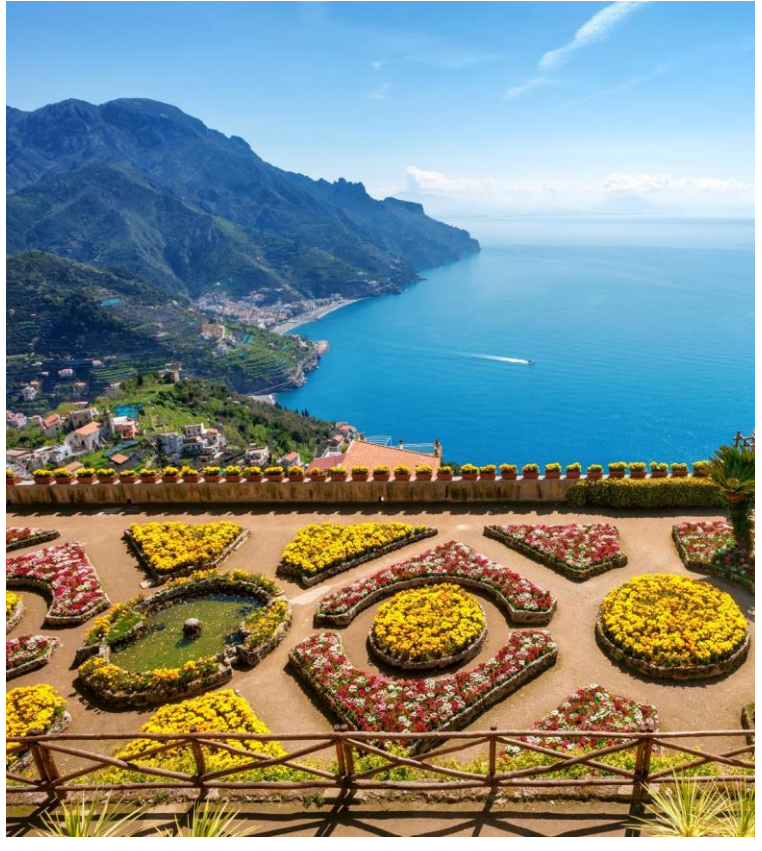
Small Group Travel rewards travelers with new perspectives. With just 12-24 passengers, these are the personal adventures that today's cultural explorers dream of.

14 Days • 19 Meals: 12 Breakfasts, 2 Lunches, 5 Dinners